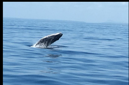
Humpback whale breaching at South Pangani reefs.

Humpback whales ( Megaptera novaeangliae ) are present in Tanzanian waters from June to November each year. They spend the austral summer months (Nov-March) in Antarctica feeding and make the long migration to give birth and mate in the relatively safe, warm tropical waters of East Africa. Now that whale hunting has largely ceased, humpback whale populations in East Africa are believed to be steadily increasing in number, and, as a consequence, humpback whale sightings in Tanzania and other nearby regions are becoming more common.