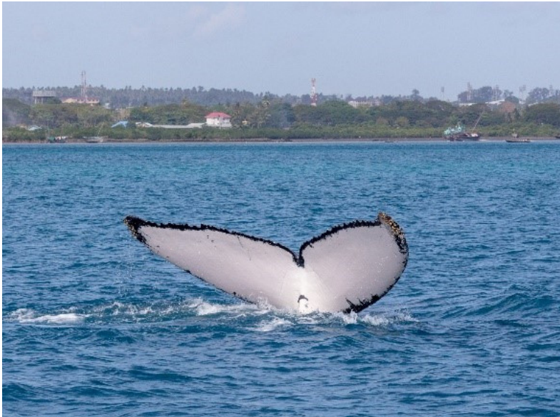
Humpback whale surfaces in view of Zanzibar.

By Gill Braulik & Danielle Stern (gillbraulik@downstream.vg)