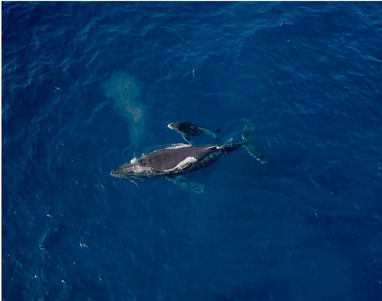
Mother & calf at Latham Island.